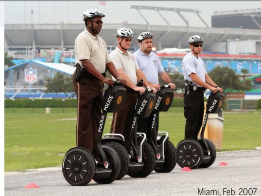
Miami, Feb. 2007

To learn more information or to find a local Authorized Segway Dealer, please visit www.segway.com/police or call 866.4SEGWAY